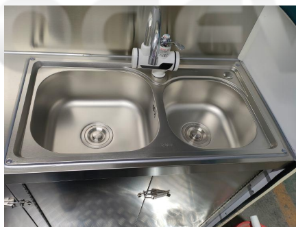
- Sinks -