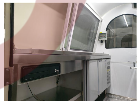
- Interior -