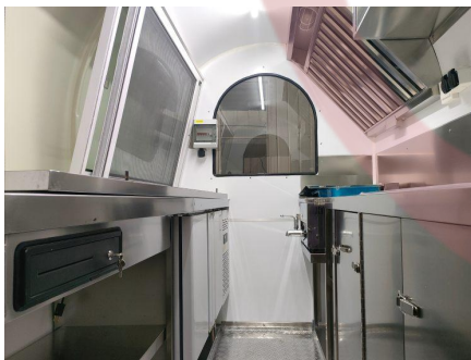
- Interior -