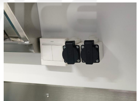
- Sockets -