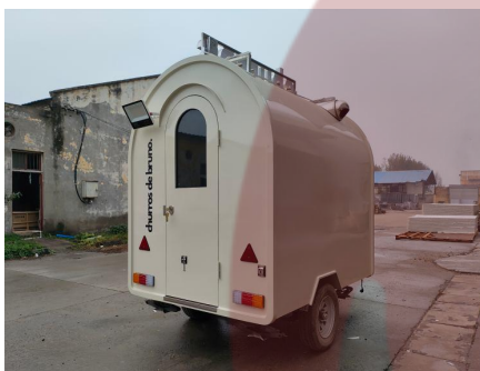
- Door -