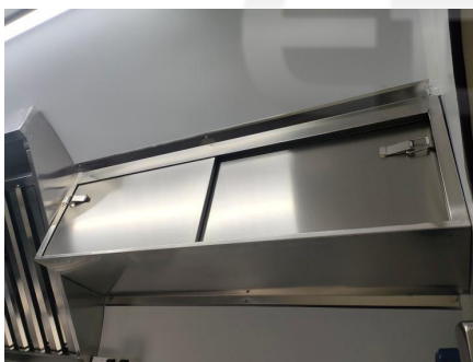
- Cabinets -