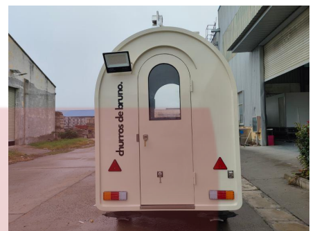
- Tail Lights -